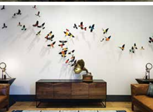
photo booths to incorporating over-the-top branded displays or visually stunning décor into event design.

Some argue that while the influence of this group is growing, it's not entirely new.